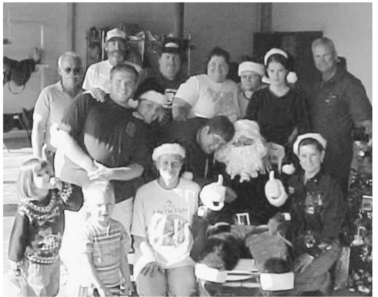
SOUTH CAMERON HIGH School Character Counts, the Beta Club, Civics Class and other students collected gifts for their 2nd Annual Toy Drive. The Cameron Volunteer Fire Department also collected money to purchase gifts for needy children. Approximately 300 gifts were collected and distributed to children who came to visit Santa at the Fire Station on Saturday, Dec. 21st. Pictured at left are some of the gifts collected and pictured above are some of the students and members of the Fire Department who helped Santa distribute gifts.