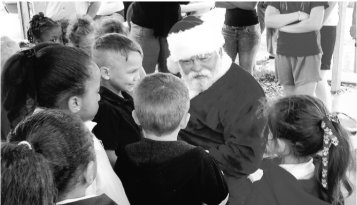
SOUTH CAMERON High School campus greeted Santa Claus as he arrived by fire truck on Dec. 20. He visited the Pre-K through third grade classrooms, giving presents to the students.

The staff of the Cameron Pilot wishes you all a safe and successful 2008 La. Fur and Wildlife Festival