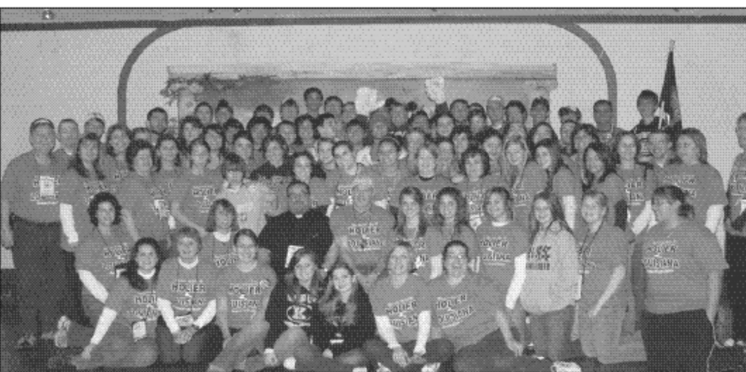
Eighty-five youth and various adult chaperones attended the 29th Biannual National Catholic Youth Conference held last November in Columbus, Ohio. The trip was coordinated by the Office of Youth Ministry of the Diocese of Lake Charles.

The young of the Church are stepping up and taking an active role in the Church today. Knowing sometimes we don't always have a map to show us the way, making us go into