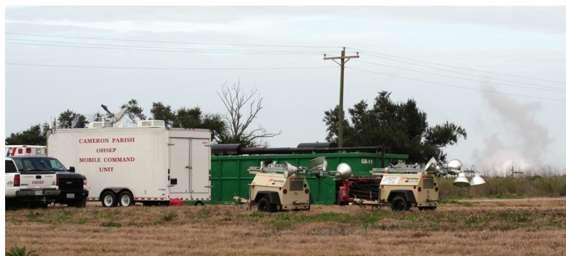
THERE WAS A gas well blow out near Hwy. 82 between Oak Grove and Grand Chenier Sunday night. Fortunately there was no oil or gas in the spray and there was no threat to the area. The Cameron Parish Mobile Unit was on the scene to help out.