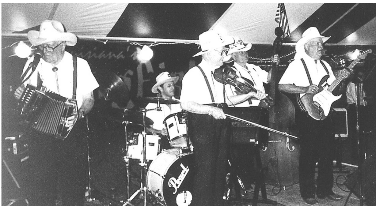
The Hackberry Ramblers

Formed in Hackberry in 1933, the band has been playing French and country music for 69 years. In 1998 they were nominated for a Grammy Award.