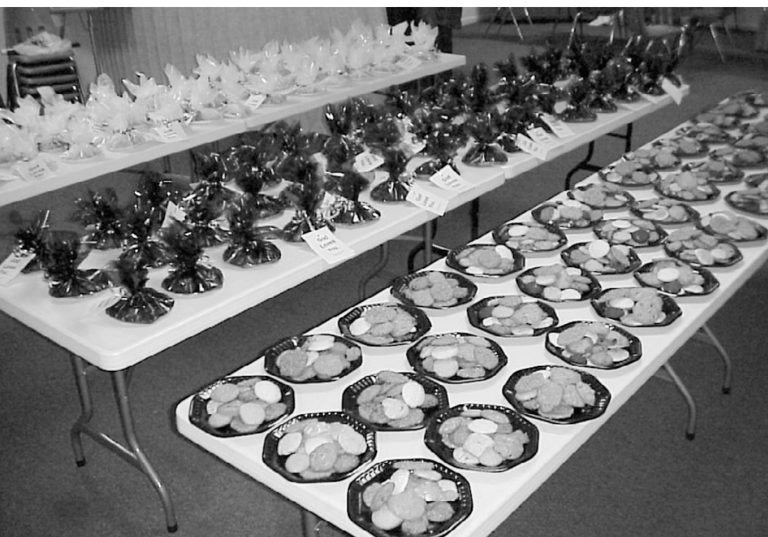
FIRST BAPTIST CHURCH of Cameron delivered Valentine cookies to area businesses and agencies last Friday. Over 1600 cookies were distributed to 140 locations as a gesture of goodwill and appreciation.