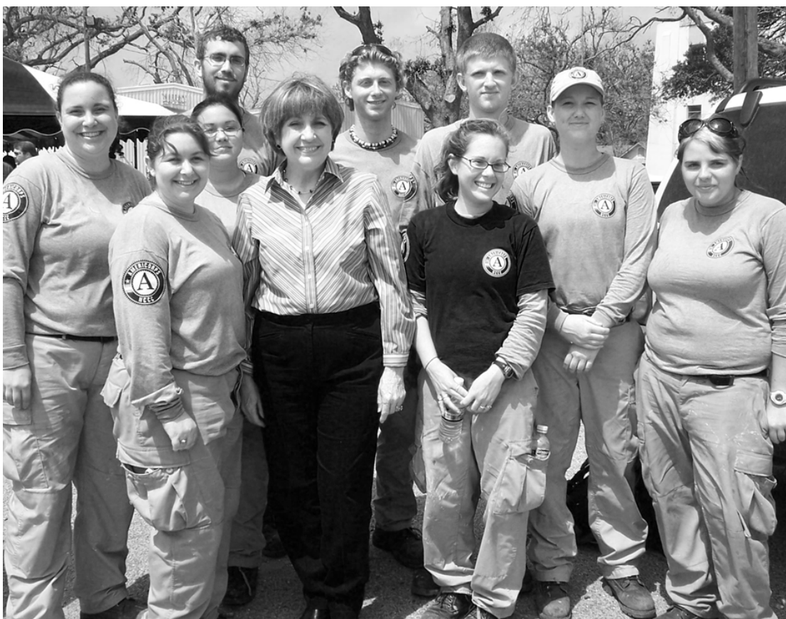
GOV. KATHLEEN BLANCO is shown with the Denver, Col., based Americorps team designated Fire-6, now serving a five week assignment helping Cameron Parish's hurricane recovery.