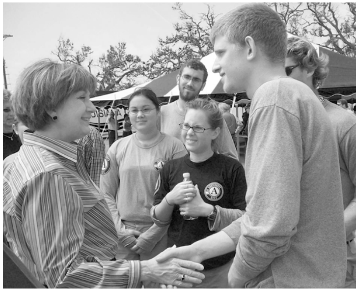
GOV. KATHLEEN BLANCO greets and encourages Americorps members who are working in Cameron Parish. Members sign up for 10 months of intensive service, putting in five weeks in each area of need. This team is based in Denver, Col.