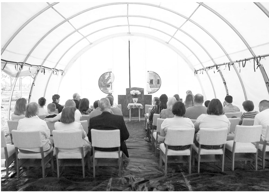
FIRST BAPTIST Church of Cameron held its first service in their new tent on Sunday.