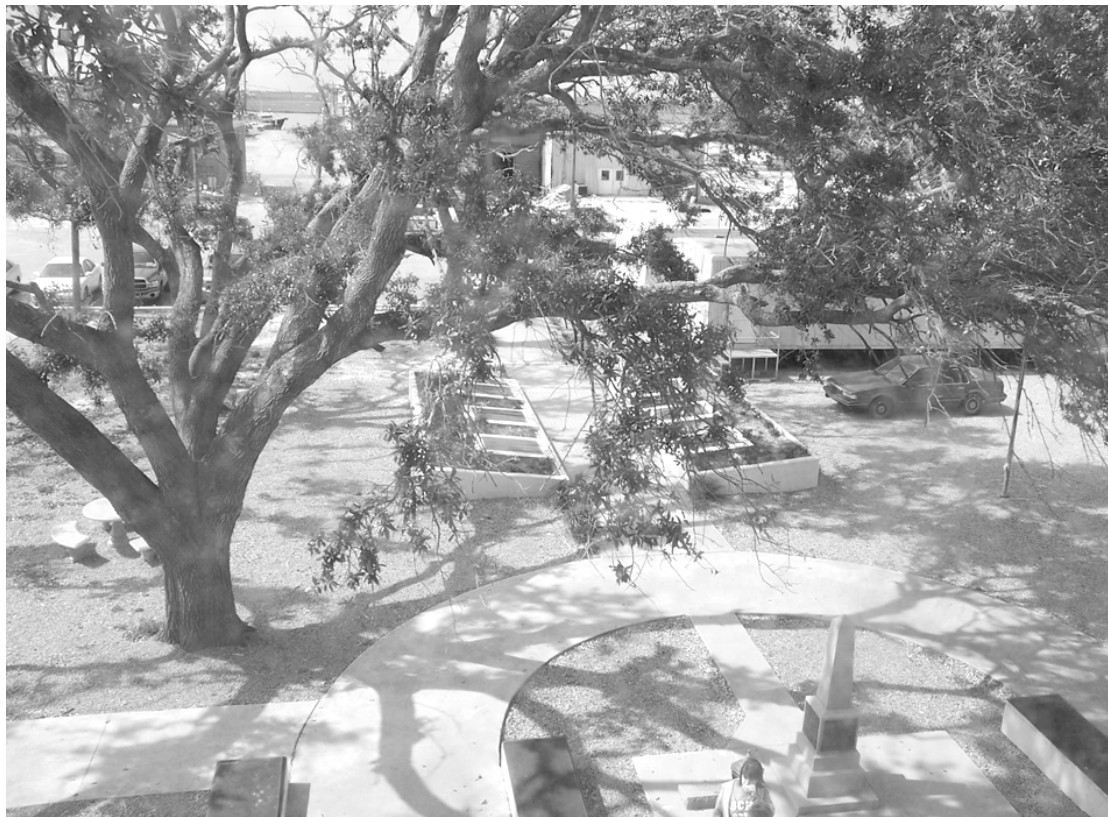
THE VIEW FROM the Cameron Courthouse windows is much neater than it was six months ago.

The system is not eligible for disaster recovery funds either, because it had not yet been built when the storm hit.