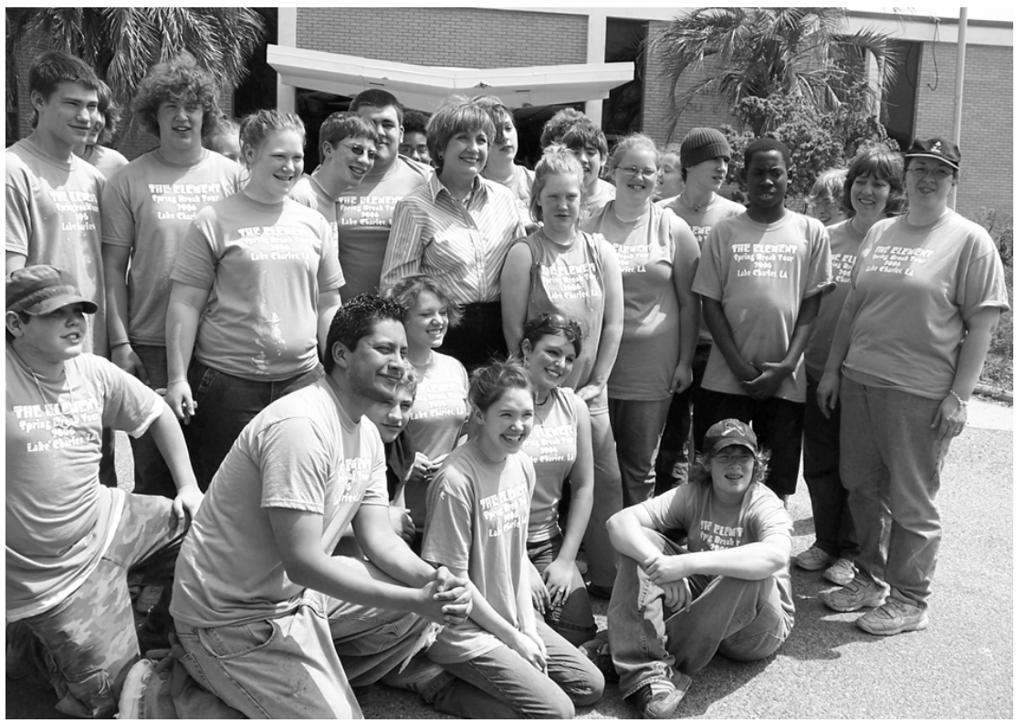
MEMBERS OF The Element, a church youth group from Columbus, Mo., got to meet Louisiana's governor, Kathleen Blanco (center,) while they were working in Cameron last Friday. The governor praised the youth for giving their time and energy to help others.

The power is in the hands of the Police Jury. Everything has a price, but our freedom is not for sale. It's high time we