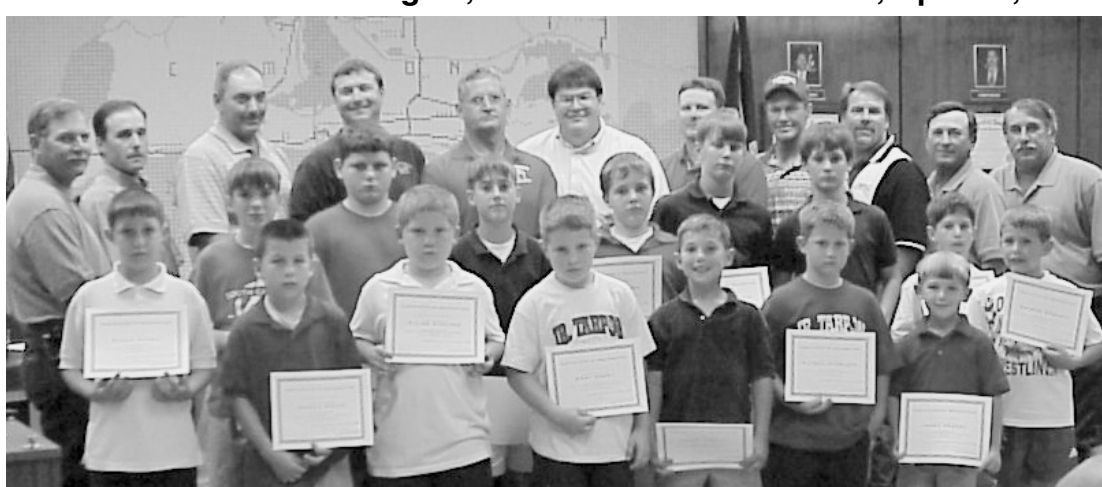
CAMERON ELEMENTARY and South Cameron Elementary School wrestlers who recently were winners at a wrestling meet in Sulphur were honored by the Cameron Parish School Board at its monthly meeting Monday. They are pictured with their coaches.

Today, the title is chang- ing, but the recognition is equally important. The com- mon term today is Administrative Professionals as the role has generally changed significantly since 1952, and for the better at that.