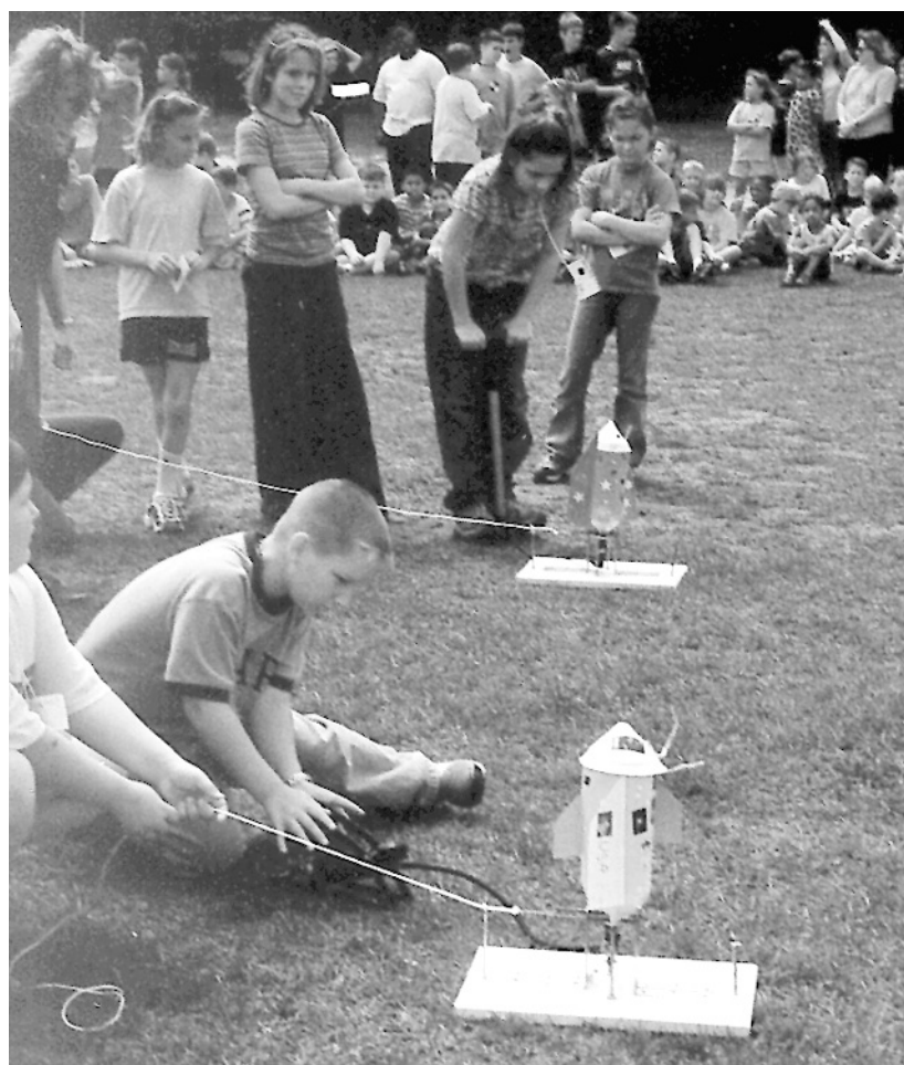
SOUTH CAMERON Elementary School students are pictured launching self-made rockets during their observance of National Space Day last week.

Memorial contributions may be made to First United Methodist Church of Nederland.