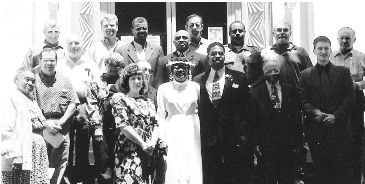
SHOWN ABOVE on the Cameron Parish Courthouse steps were the participants in the World Day of Prayer annual observance held at noon, Thursday, May 3. The group included ministers, public officials, and members of the Cameron NAACP chapter, which sponsored the observance.

On Sunday at the 10 a.m. service a police appreciation program was held in First Baptist church in Cameron, with the Cameron Parish Ministerial co-sponsoring the observances.