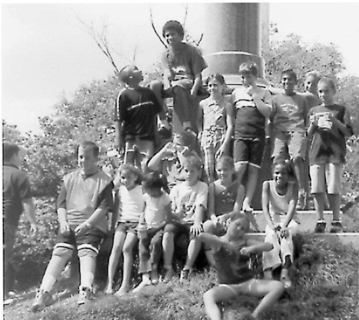
SOME OF THE students of the third grade classes of Cameron Elementary School are shown taking a break on the grounds of the Old State Capital in Baton Rouge while on a field trip.

The kiss of the sun for pardon, The song of the birds for mirth, One is nearer God's Heart in a garden Than anywhere else on earth. {from 'God's Garden'} - Dorothy Frances Gurney