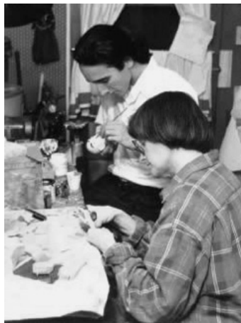
THE CAMERON PARISH Library will host a free puppet show on Wednesday June 11, at 10 a.m. at the Main Branch of the library and again at 2: p.m. at the Grand Lake Firemans Center featuring Hobgoblin Hill Puppets.