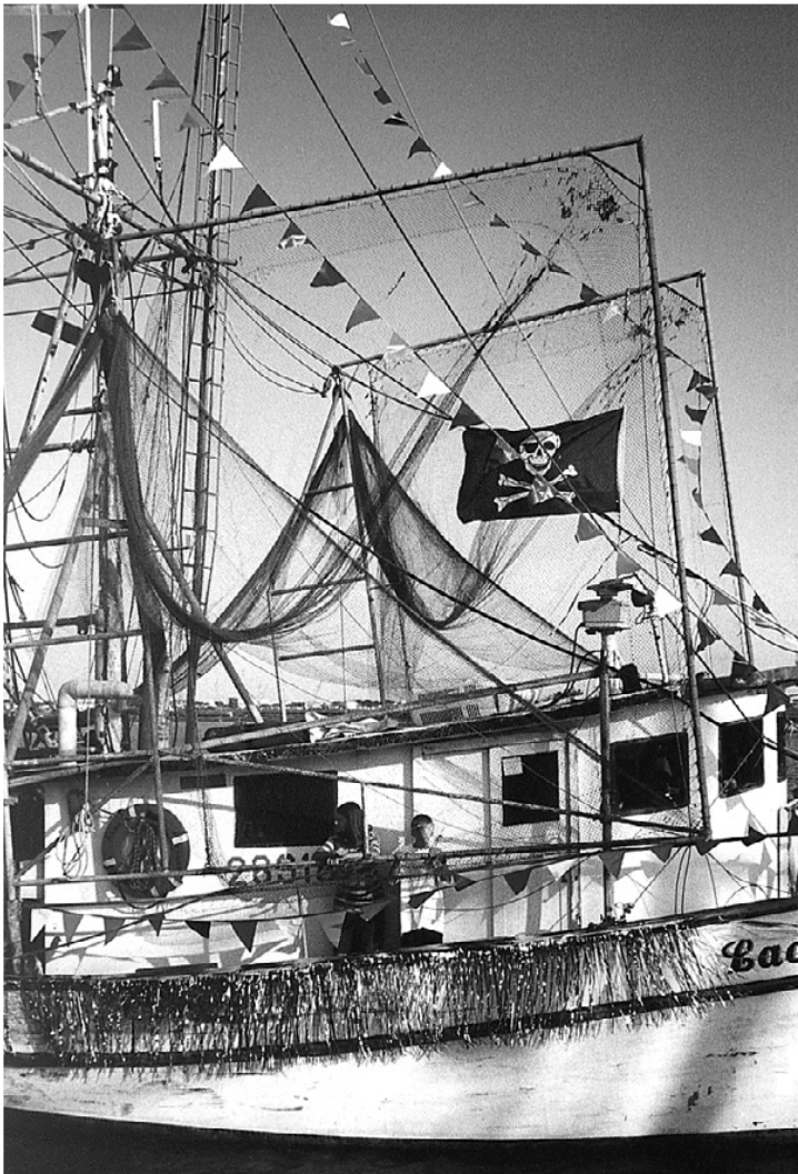
BRIGHTLY DECORATED fishing boats such as the above will take part in the Blessing of the Fleet which will kick off the Cameron Salt Water Fishing Rodeo on Saturday, Aug. 7 at 10 a.m. at the Cameron Jetty Fishing Pier 2.

Saturday, Aug. 7 will be a big day in Cameron when a new facility is dedicated, a blessing of the fleet is held and a salt water fishing rodeo is conducted. Events will begin at 10 a.m. with a flag ceremony.