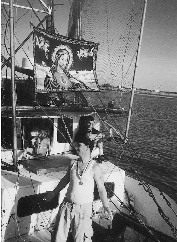
A BLESSING of the Fleet ceremony will be held Saturday, August 7 in connection with a salt water fishing rodeo to be held at the Jetty Fishing Pier Park in Cameron. The above photo of a decorated boat was taken at a Fleet Blessing held here a few years ago.