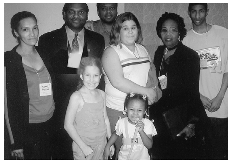
THESE WERE the members of the Cameron NAACP delegation who attended the national NAACP convention in Philadelphia recently.