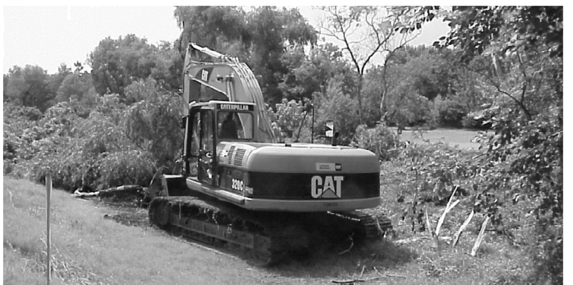
WORK HAS BEGUN in Cameron on a drainage project to help flood water which may become trapped in low lying subdivisions reach the pumping station. The borrow ditch along Hwy 27/82 is being cleaned from School Board road all the way behind Cameron Elementary School to the pumps.