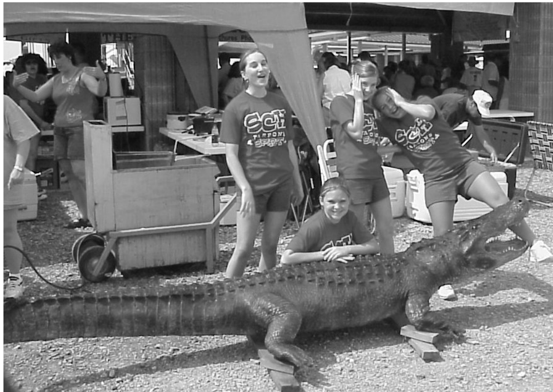
SOUTH CAMERON High School Cheerleaders clown around with the big gator at their fund raising stand at the Cameron Fishing Rodeo. The team sold fried alligator and photos with the giant gator.

The U. S. Space Shuttle made its first test flight on August 12, 1977.