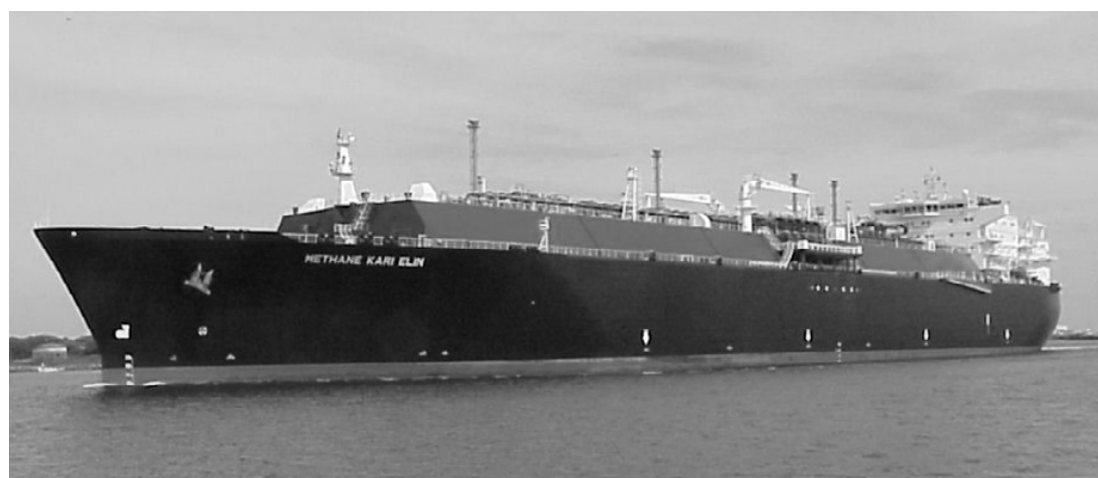
THE LNG (liquefied natural gas) tanker Methane Kari Elin was quite a sight as it passed the Jetty Fishing Pier just ahead of the boat parade.