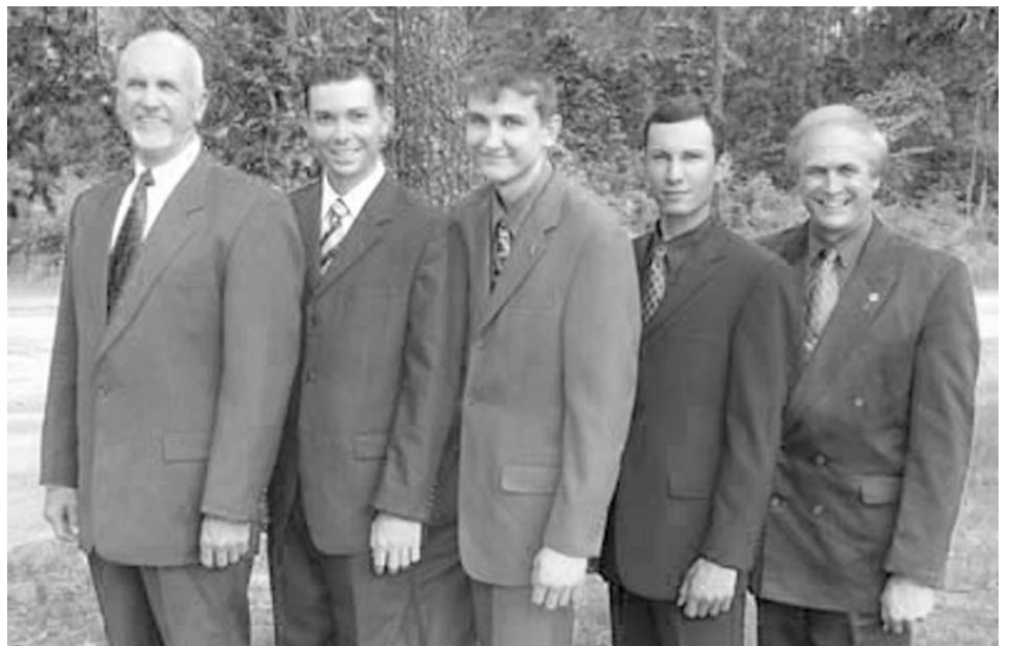
THE SOUTHERN PLAINSMEN Quartet will give a free gospel concert at 6:30 p.m., Saturday, Aug. 27 at the Hackberry United Methodist Church. The group has recorded 17 albums and makes appearances all over the country.