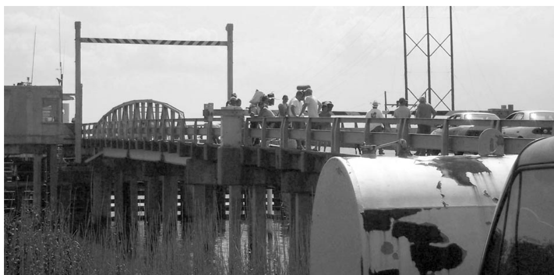
THE MERMENTAU RIVER Bridge in Grand Chenier was the location on Tuesday for some road action scenes for the movie "Little Chenier" being shot here.