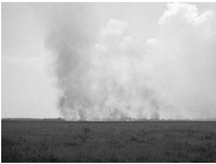
LIGHTNING SPAWNED by recent thunderstorms ignited several marsh fires around the parish, like this one south of Hwy. 82 near Oak Grove. Occasionally, thick smoke filled residential areas or blew across the highway. These fires are a natural part of the marsh system, and are left alone as long as they do not threaten homes or businesses.