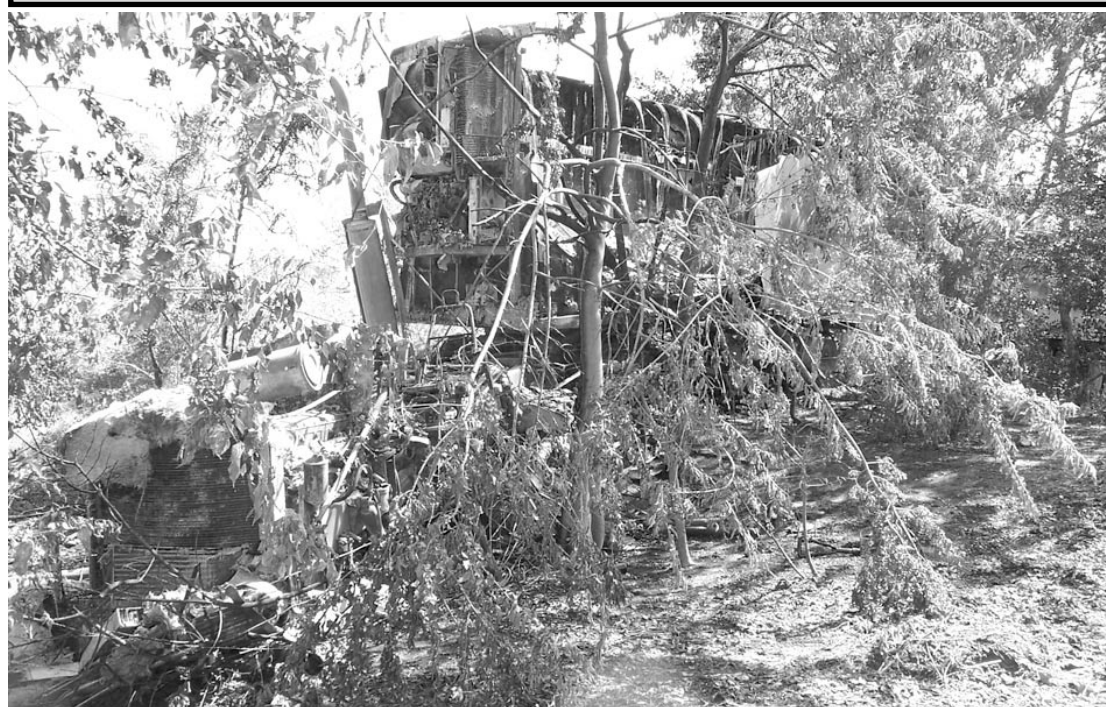
THIS WAS the remains of a tractor-trailer rig that crashed and burned between Oak Grove and Grand Chenier Tuesday morning. The truck driver was killed.