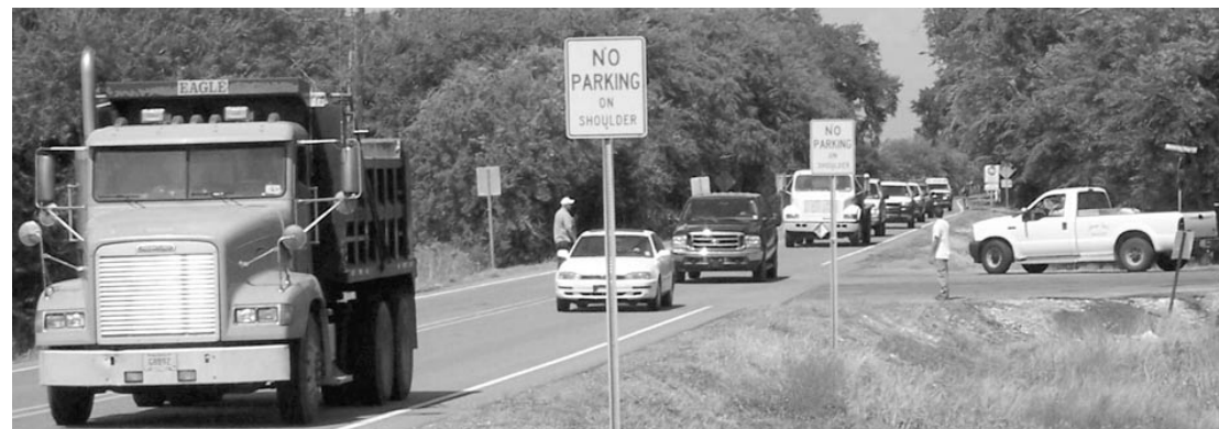
TRAFFIC WAS DELAYED periodically during the day Tuesday as scenes for the movie "Little Chenier" were filmed on the Mermentau River Bridge.