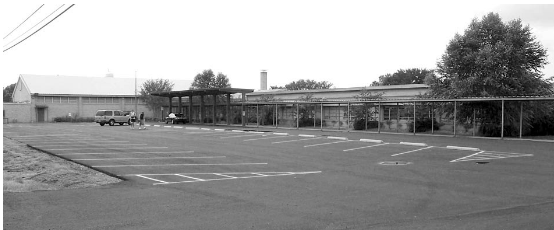
GRAND LAKE School students will enjoy a new blacktop parking lot surface as the school year begins this week.