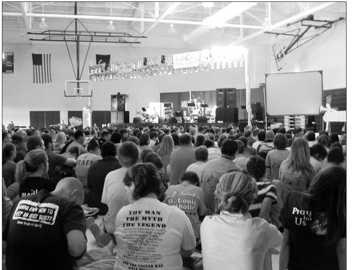
Nearly 2,000 young people, children and adults attended the recent daylong Proud 2B Catholic Music Festival held at the Sulphur High School Freshman campus. The faith-filled event for the entire family featured celebration of the Eucharist, pictured here, along with a variety of Christian music, motivational speakers, and ministry talks. The Second Annual Proud 2B Catholic Music Festival is scheduled for September 8, 2007.

For more information call 337-439-7426, Ext. 19.