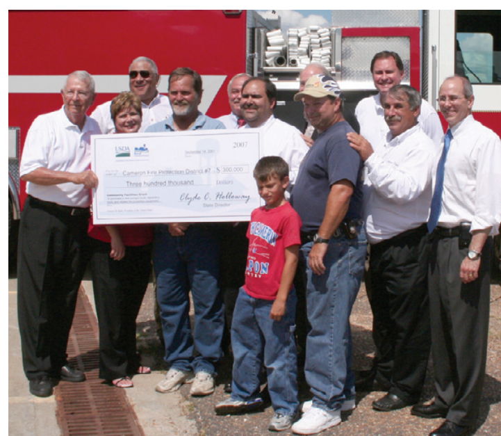
THE CREOLE Fire Department accepted a $300,000 USDA Rural Development grant to be used for a pumper truck, apparatus truck, and related fire equipment.