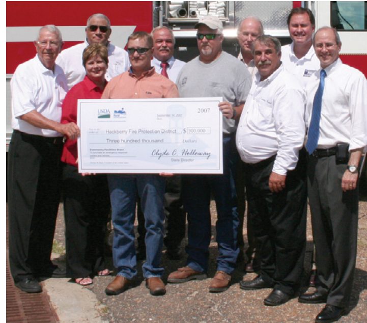
THE HACKBERRY Fire Department accepted a $300,000 USDA Rural Development grant which has been used for an emergency response system and vehicle.

For generations, the old house was a refuge for those fleeing from high waters that often flooded the area. It withstood the ravages of Hurricane Audrey in 1957, but is no longer in existence.