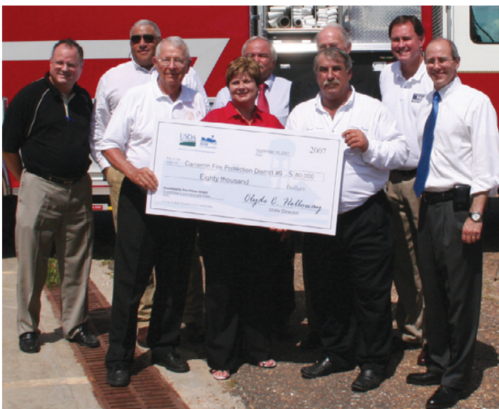
THE GRAND CHENIER Fire Department was awarded a USDA Rural Development grant of $80,000 to buy a new command post trailer. Parish officials accepted on their behalf.