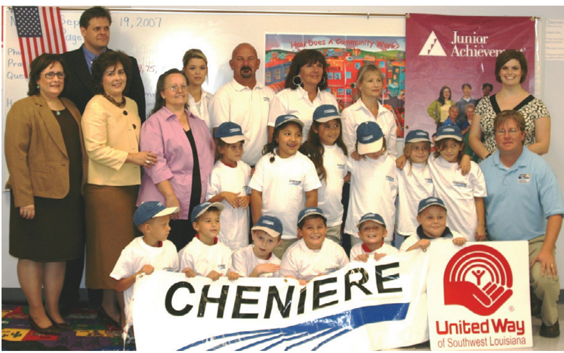
JUNIOR ACHIEVEMENT Day was held Thursday, Sept. 20 at Johnson Bayou High School. Shown above are students, teachers, members of United Way and Junior Achievement, and representatives from Cheniere Energy.