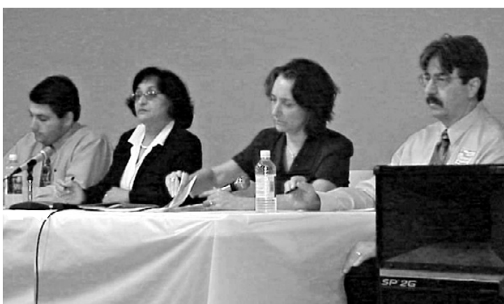
MEMBERS OF the FERC committee heard comments at Johnson's Bayou meeting last week about the proposed LNG plant. Most of the comments were favorable.