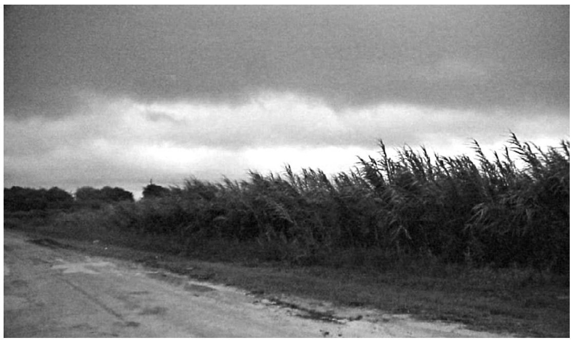
CLOUD BANDS just north of the eye wall of Ivan crossed Cameron Parish last Thursday evening. Fortunately, damage was minimal to the parish.