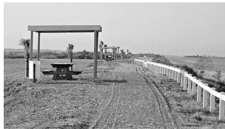
THE NEWLY COMPLETED Hackberry Walking Trail is now open to the public. A grant from Louisiana Recreational Trails, which is under the Governor's Office of Rural Development, in the amount of $46,110 paid for the walkway. Several pavilions along the path provide picnic and rest areas.