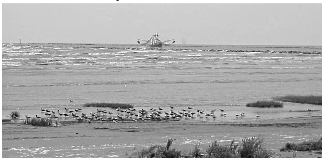
A SHRIMP BOAT is shown moving in to safety before Ivan made landfall last Thursday in Cameron Parish. Hurricane Ivan made landfall in Alabama on Sept. 16 and then had traveled the usual path up the eastern coastal states, before spinning an off-shoot back into the Gulf of Mexico. Tropical depression Ivan caused high tides and some flooding in Cameron Parish.