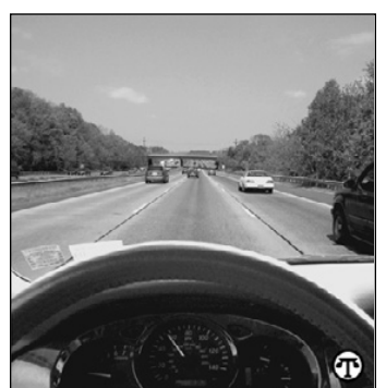
Driving habits affect a vehicle's fuel consumption.