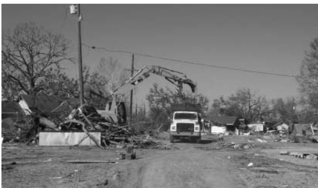
AT LEAST FOUR of these debris-removal units were at work in Cameron clearing streets on Tuesday. Other units were working around the parish as well.