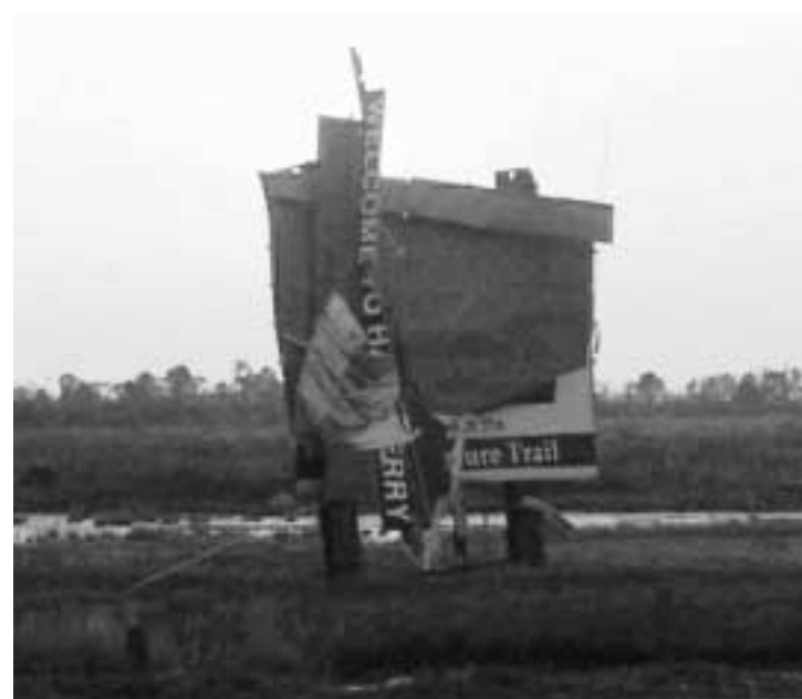
'WELCOME TO HACKBERRY' sign is worse for the wear after Rita's visit.

I am so excited that my great-grandchild is visiting here with her parents at my daughter's house and we are going shopping while the men are at the LSU ball game. She is so smart, can already say her ABCs and can count to 100. She will not be two years old until February.