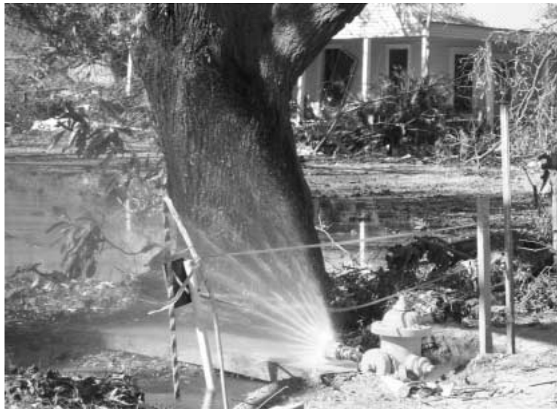
WATER IS FLOWING near the Cameron Parish Courthouse. This hydrant is open to flush the lines.