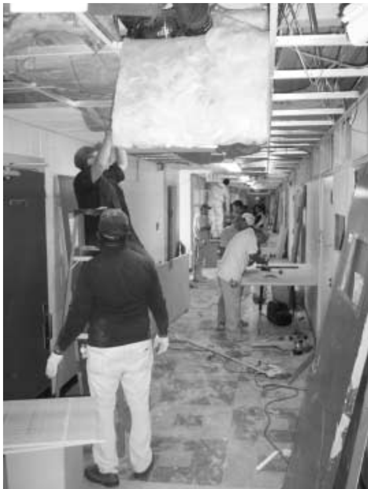
WORKMEN ARE shown busily getting Grand Lake High School in shape for opening on Thursday, Oct. 27. Hackberry High School will also open on that date. Cameron Elementary and South Cameron Elementary and High School students will also report to Grand Lake. Johnson Bayou students will report to Hackberry. The four schools in lower Cameron Parish were destroyed by Hurricane Rita.