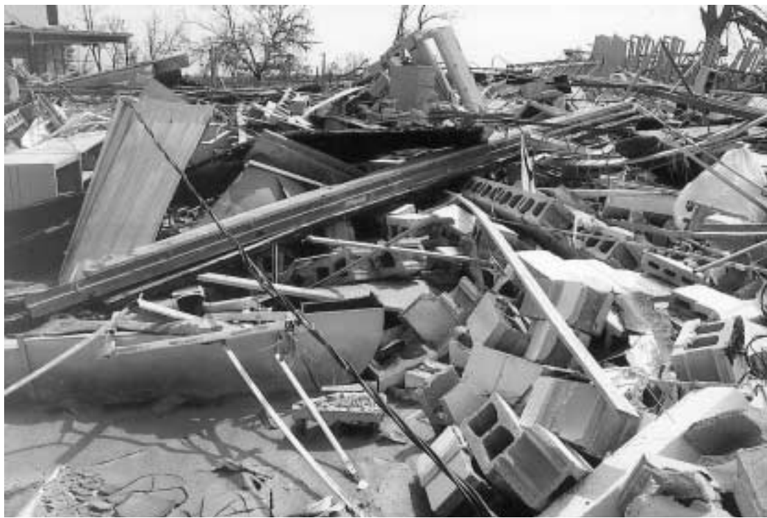
THIS RUBBLE was all that was left of the Cameron Parish Library in Cameron following Hurricane Rita. The library building was a gift to Cameron Parish by the Louisiana Jaycees following Hurricane Audrey 48 years ago. Plans are being made for a new library building in Cameron.