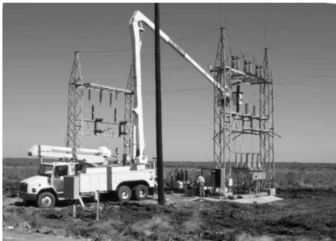
ELECTRIC CREWS have begun to repair substations damaged by Hurricane Rita. This one is located south of Hackberry.