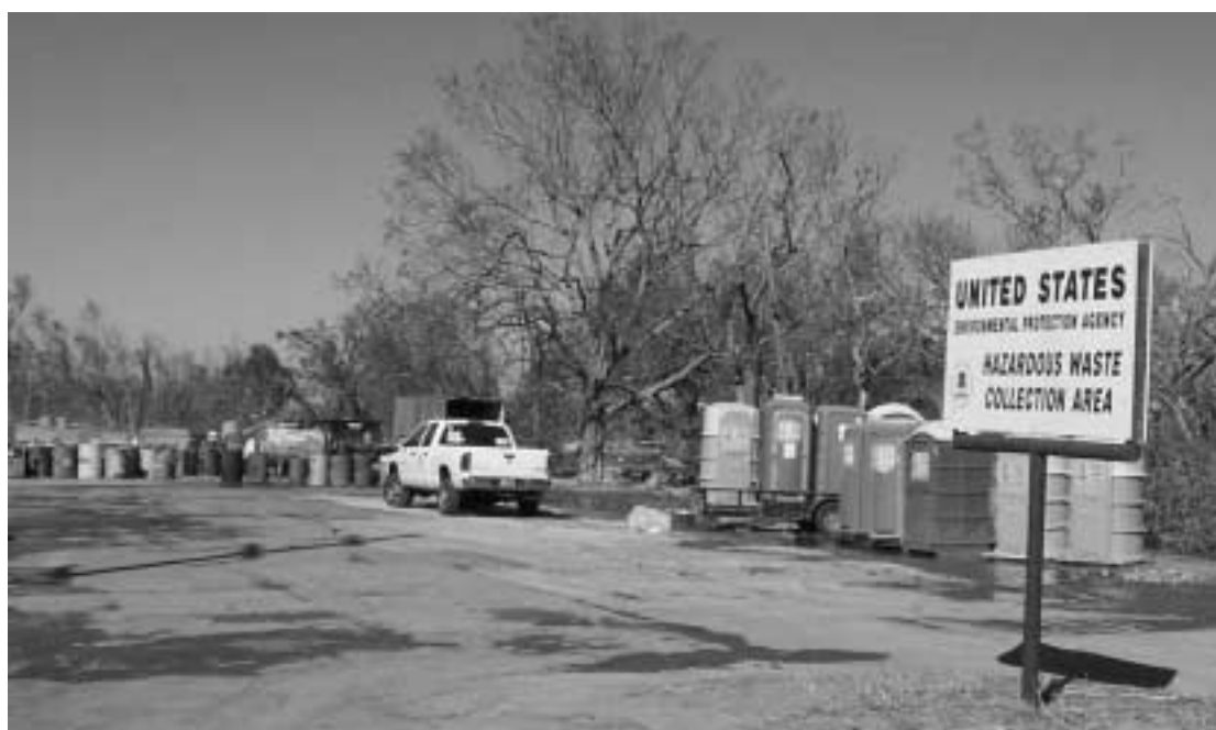
THE EPA has established sites for the collection of hazardous materials which were deposited all over the parish by the storm surge from Hurricane Rita. This site is in Cameron.