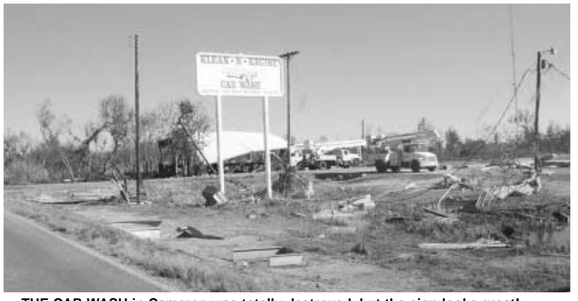
THE CAR WASH in Cameron was totally destroyed, but the sign looks great!