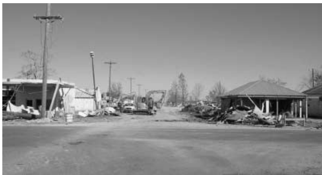
CLEANUP IS progressing in Creole. Most of the remains of the Savoie Lumber Company have been removed from the street.