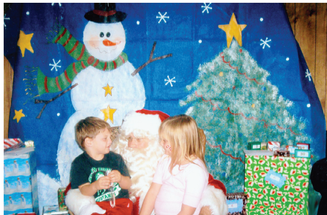
SANTA IS shown with two young attendees at the 5th annual Hackberry Holiday Festival held last Thursday at the Hackberry Community Center. The event was underwritten by Sempra Energy Foundation with additional aid from Hackberry Duck Off, Targa Midstream Services, Cameron Communications, Hackberry High School, and Deep South Productions. See additional photos inside.