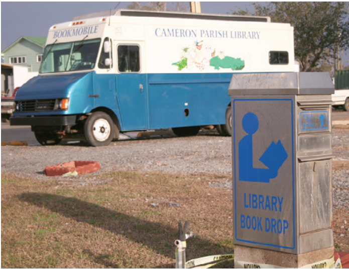
THE BOOKMOBILE has returned to the Cameron Library site and will resume operations this week. Staff expect to be open for patrons on Friday. In the near future, the Mobile Electronic Laboratory will be available with extra computers for public use.