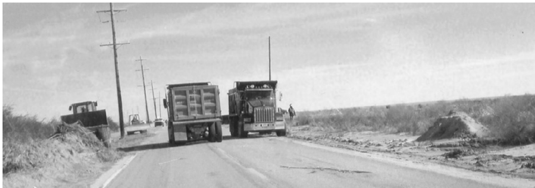
SHOULDER WORK is being done on Hwy. 82 east of Holly Beach. The shoulders were damaged by Hurricane Ike.