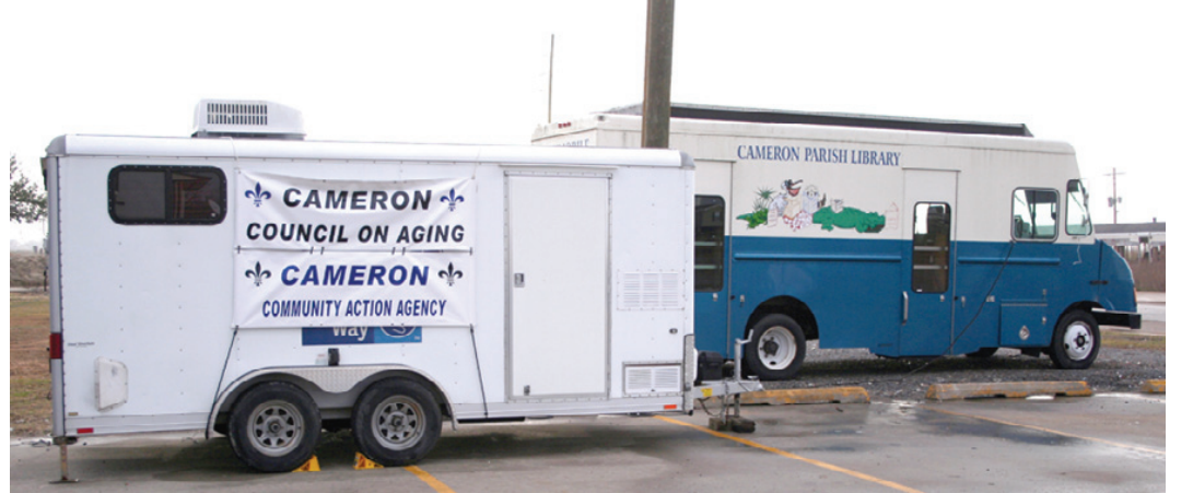
THE CAMERON Council on Aging and Cameron Community Action Agency have set up a mobile unit in Cameron, next to the Cameron Library, to provide assistance to local residents.