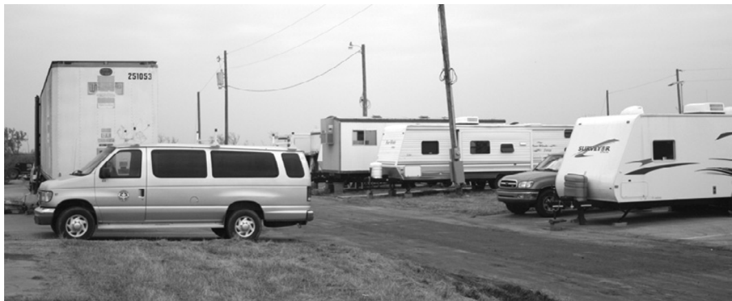
FOR THE third year in a row, Mennonite Disaster Services has set up a base camp at the former Cameron Place Apartments. Volunteers have begun foundation work on a house in Hackberry. Beginning in January teams will be building three Cameron Parish homes, the Hackberry project and two homes in the Cameron area.

*if left untreated, will impair or endanger the land;