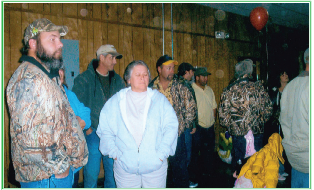
Parents and friends watched the cakewalk