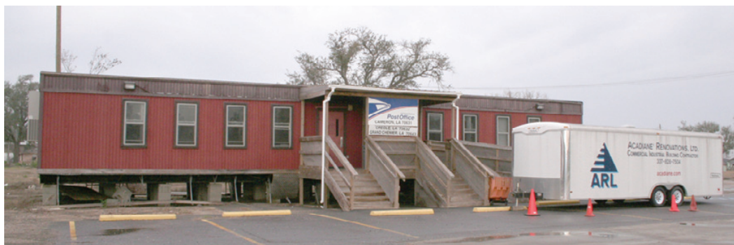
WORK HAS BEGUN to prepare the Cameron Post Office, which flooded in Hurricane Ike, to be removed. A replacement mobile unit is expected to arrive later this month.