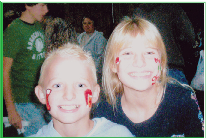
Swire children with holiday face paintings