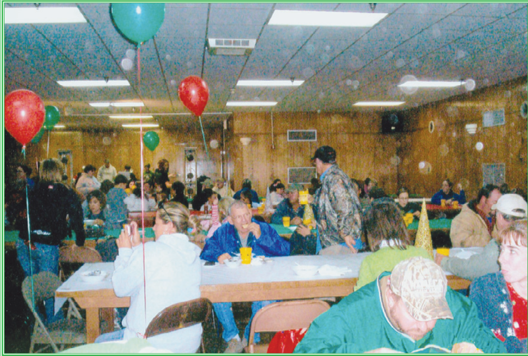
Some of the guests