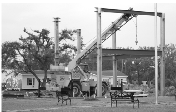
STEEL IS finally going up at the Cameron Fire Station, a welcome sight to the community. The Grand Chenier Fire Station, being built by the same contractor, is a bit further along. Both projects are being funded through FEMA public assistance grants.