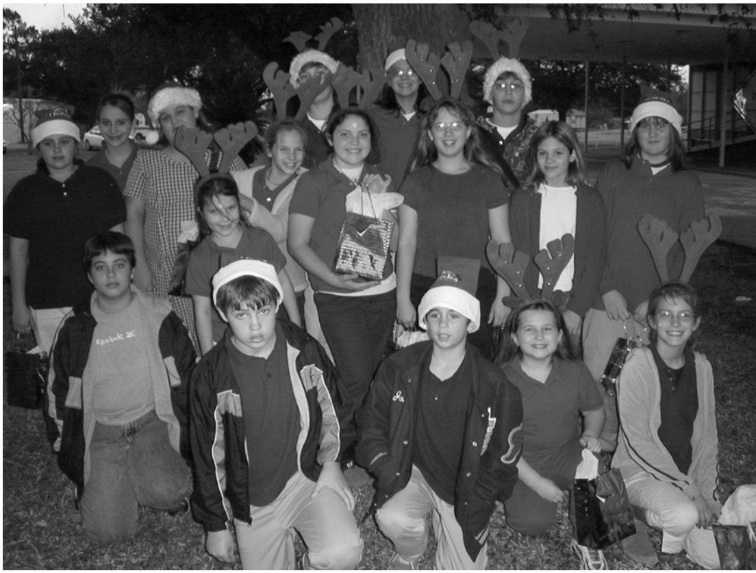
CAMERON ELEMENTARY 4-H Club members recently delivered gifts and sang Christmas carols to the patients at South Cameron Memorial Hospital.