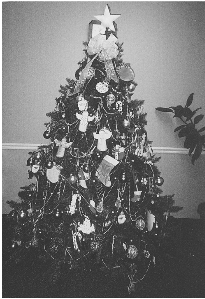
CHILDREN FROM the Cameron Parish Outreach, Grand Lake Recreation Center, and the Calcasieu Women's Shelter decorated this Christmas tree with handmade ornaments. The tree is displayed at the Family Courthouse in Lake Charles.

If you want to spread some Christmas cheer and help a worthy organization as well, be sure to buy your Christmas tree from the Cameron Optimist club. The trees arrived this week and are being sold in Cameron next to