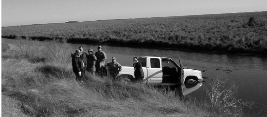
THESE HUNTERS had an unhappy ending to a duck hunt south of Hackberry Friday when their truck ran off into the roadside canal. No one was injured.